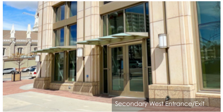
Secondary West Entrance/Exit