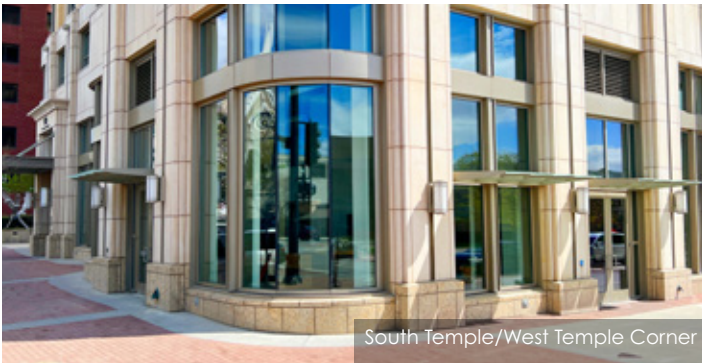
South Temple/West Temple Corner