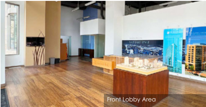
Front Lobby Area